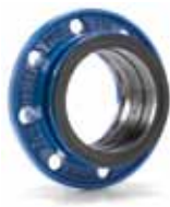
Series 05 for ductile iron pipes.