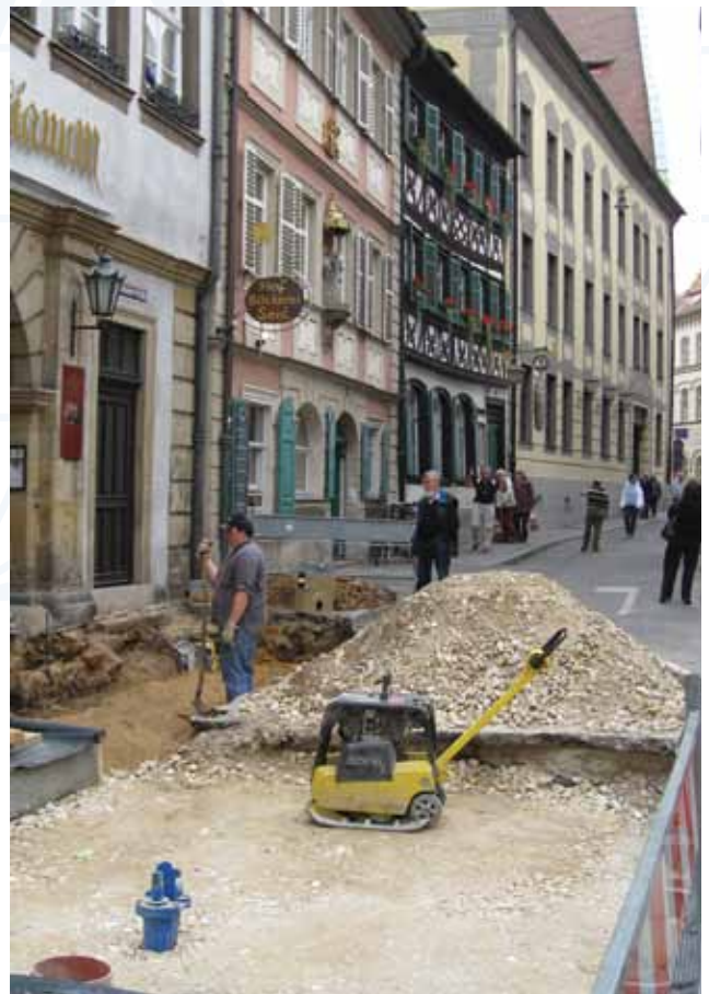
Today the historical buildings are flanked by AVK Mittelmann hydrants

The town was scarcely damaged during World War II and still retains many splendid mediaeval architectural features and over 3000 historical buildings.