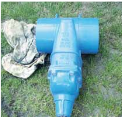
Spigot ended valve – cut to fit.