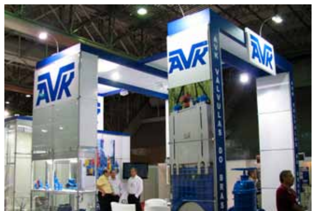
AVK Brazil at the international exhibition FITABES in Recife, Pernambuco.