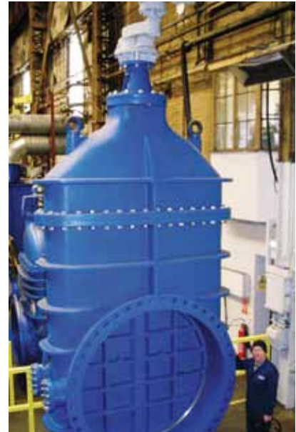
One of the Coppermills series 54 gate valves ready for dispatch.

required target dates, endorsing the company's capability for quality and on time delivery.