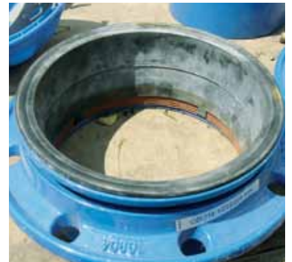
Combi flange – ready for installation.