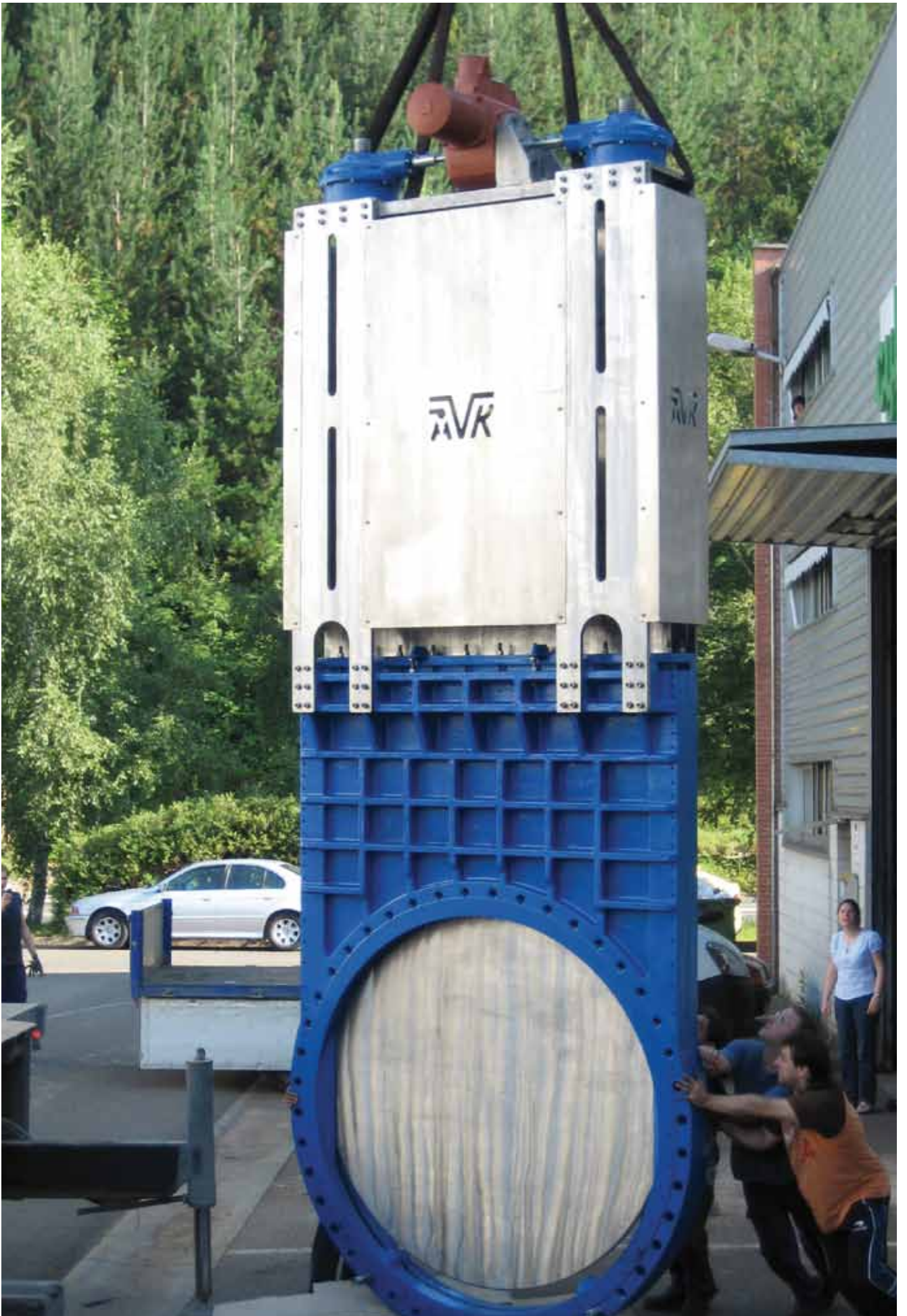
DN 1800 knife gate valve supplied to the "Onda Limpa" Project in São Paulo State.