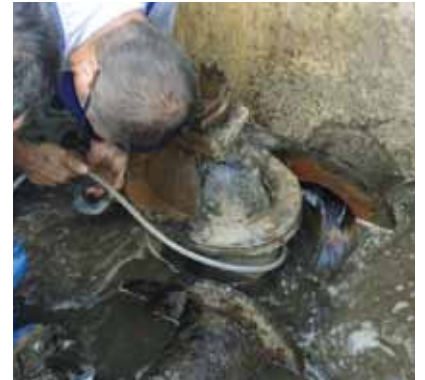
Removal of the old valve.