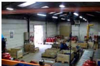
AVK HM mounting hydrants.

AVK acquired SMHM S.A. (Société Métallurgique Haut Marnaise) in December 1998 to enter the market