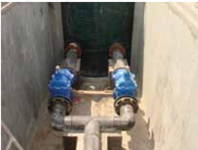
An installation with gate valves and ball check valves from Peri, sent in by Bruske Göran - W&WW.