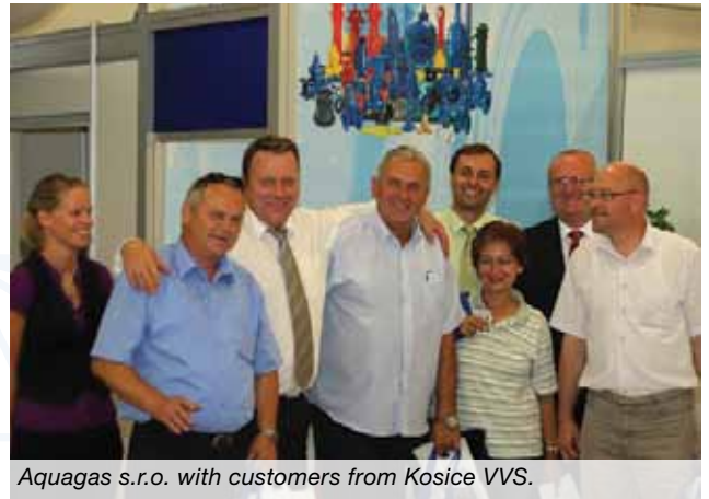
Aquagas s.r.o. with customers from Kosice VVS.

Aquagas s.r.o. is the sole agent and exclusive distributor of AVK International A/S in Slovakia, and as such present at the exhibition where the latest products were displayed, also including equipment for water exploitation and treatment with the aim to improve quality, water supply and accumulation, instruments preventing water loss and leaks, water quality inspection, and monitoring of consumption abroad and in Slovakia.