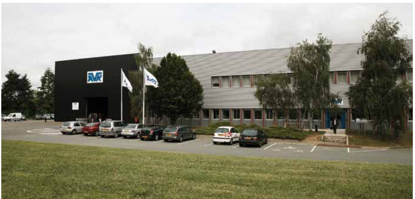
AVK France S.A. main office in Blois.

AVK France makes a large part of its turnover in the distribution segment through national and regional