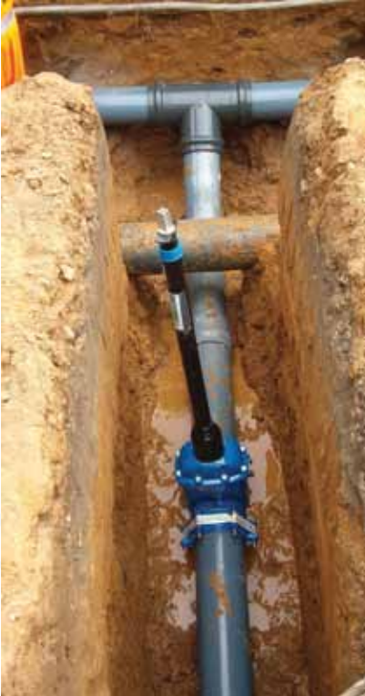
An installation with AVK Supa Plus™ valve from Skovby water works, sent in by Lars Jensen, Galten VVS-Teknik.