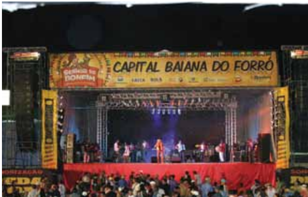
The St. John's party in Senhor do Bonfim (Bahia) is the second largest party in the Northeast region – exceed only by the Carnival.

Just like in the quote of the immortal Brazilian composer Dorival Caymmi, AVK Válvulas do Brasil Ltda. has what a “baiana” has and – “quem não tem balangandãs não vai ao Bonfim...” (who doesn’t have swing, doesn’t go to Bonfim).