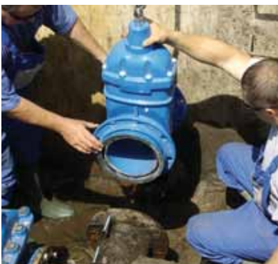
The assembled gate valve and combi flange unit before the installation.