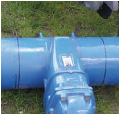
Sizing of spigot ends.