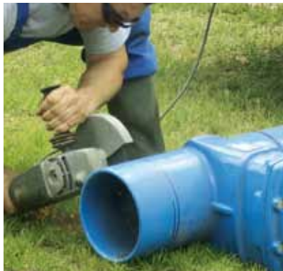
Cutting the length of the ends.