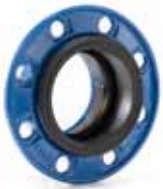
Series 05 for PE- and PVC pipes.

AVK offers support bushes at competitive prices. Please contact AVK International A/S for further information on this subject.