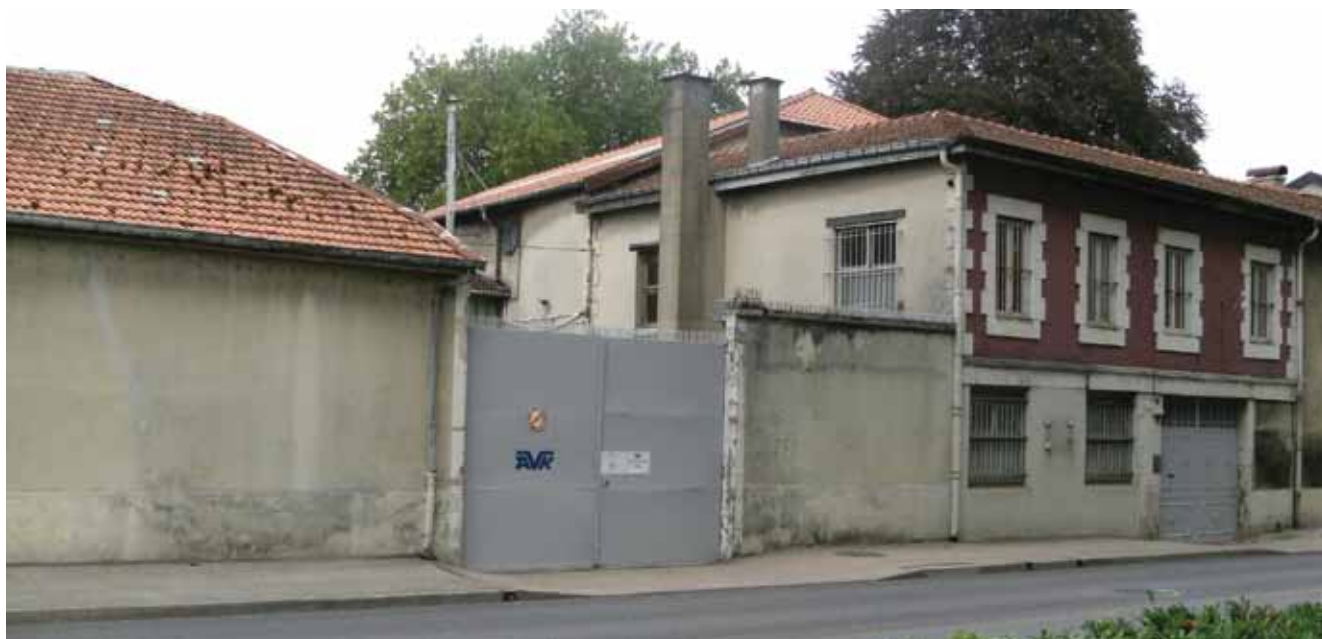
AVK HM office.