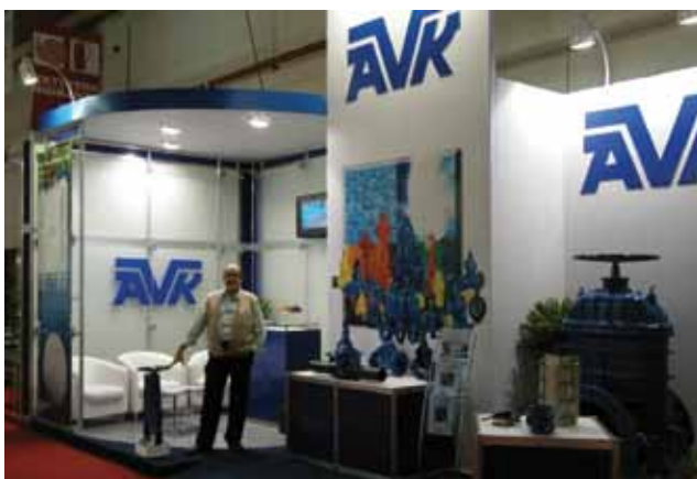
AVK Brazil attended the FENESAN exhibition in São Paulo.