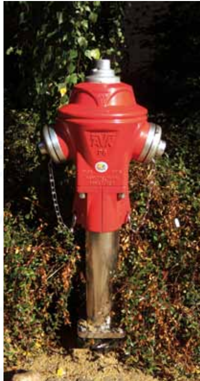
Series 84/70 - P6