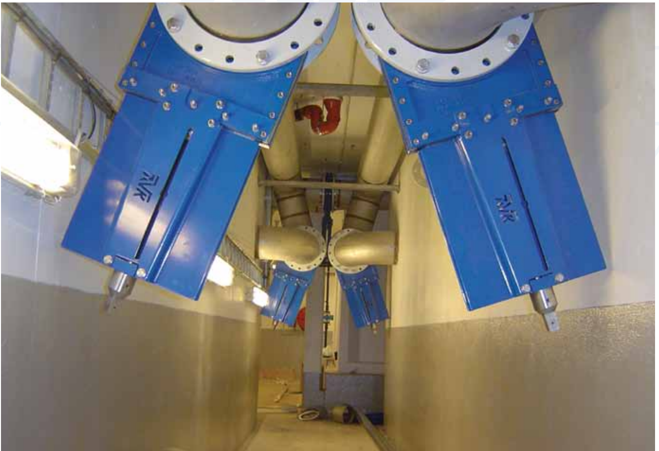
Project in Norway, Series 702 knife gate valves - sent in by Flemming Bindlev, Krüger A/S.