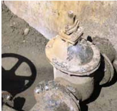
The old valve ready to be replaced with a new AVK spigot end valve and combi-flanges.

The main problem with the replacement is; the new short face to face - F4 gate valve is too short, and the long face to face - F5 gate valve is too long to replace the old valve.