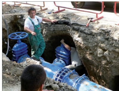
Extreme underground installation.