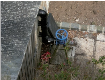
Mount Michel, Cornwall UK.