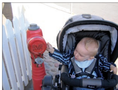
Series 09 installed in Løkken, Denmark. Sent in by Jesper Flarup, AVK International A/S.