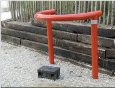
A plastic street cover installed (the wrong way) at Katwijk aan Zee, Holland on a camping site.