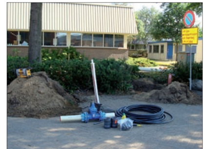
The gas supply at Wouter Witzel is now secured by many AVK Valves.